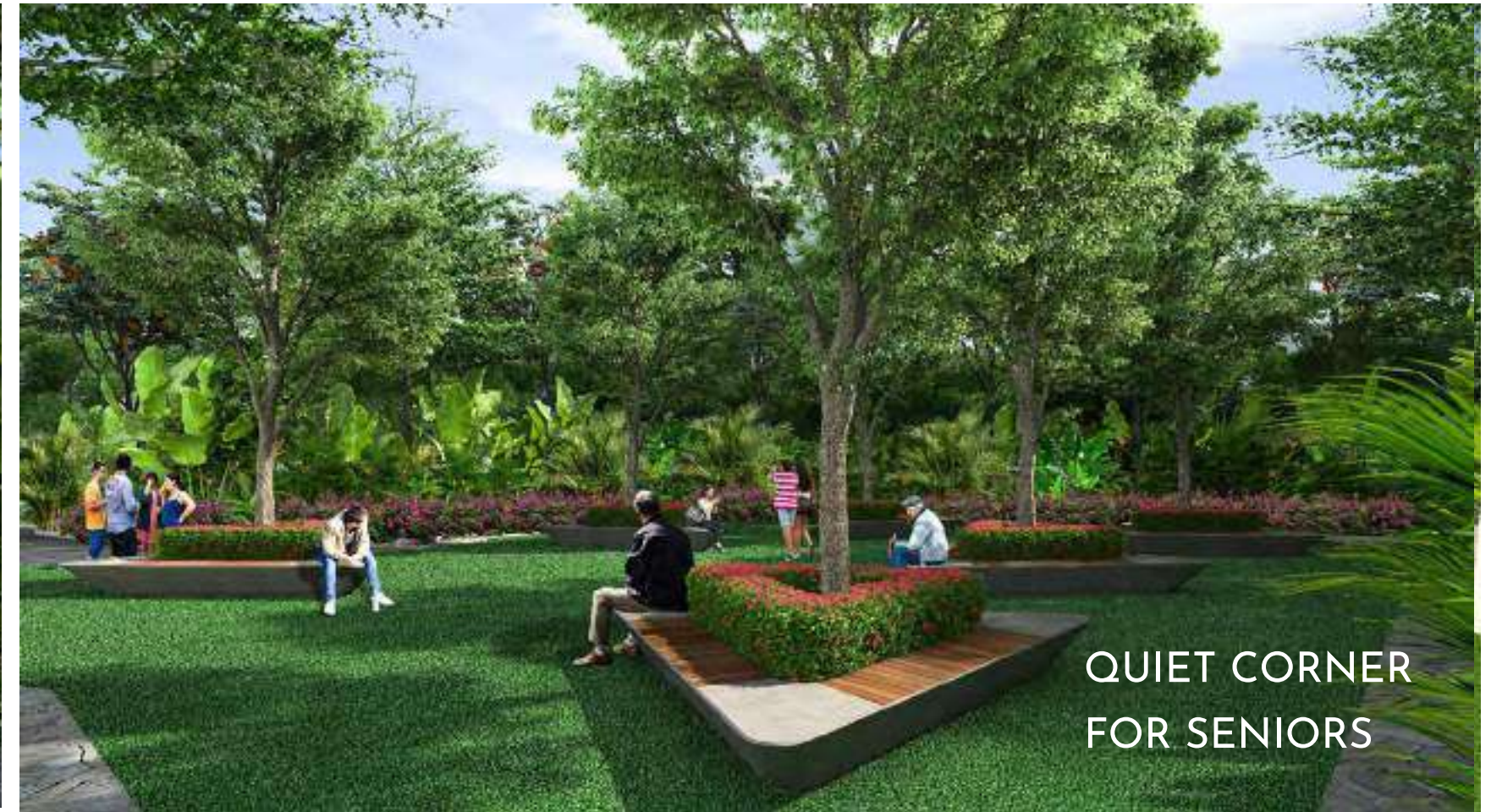
QUIET CORNER FOR SENIORS