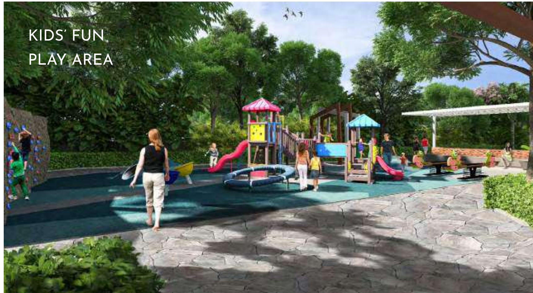
KIDS' FUN PLAY AREA