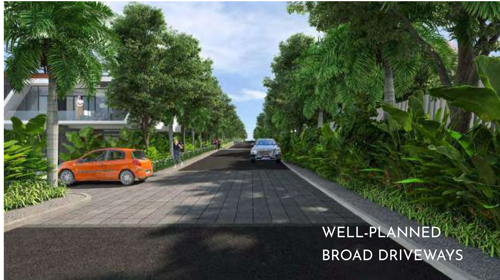
WELL-PLANNED BROAD DRIVEWAYS