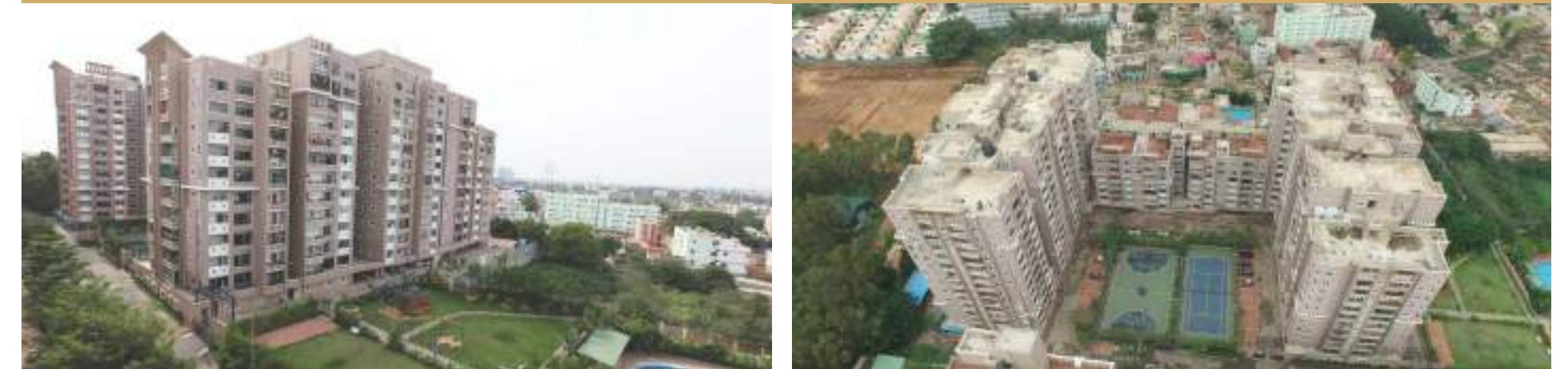
SMR VINAY GALAXY, HOODI JUNCTION, WHITEFIELD