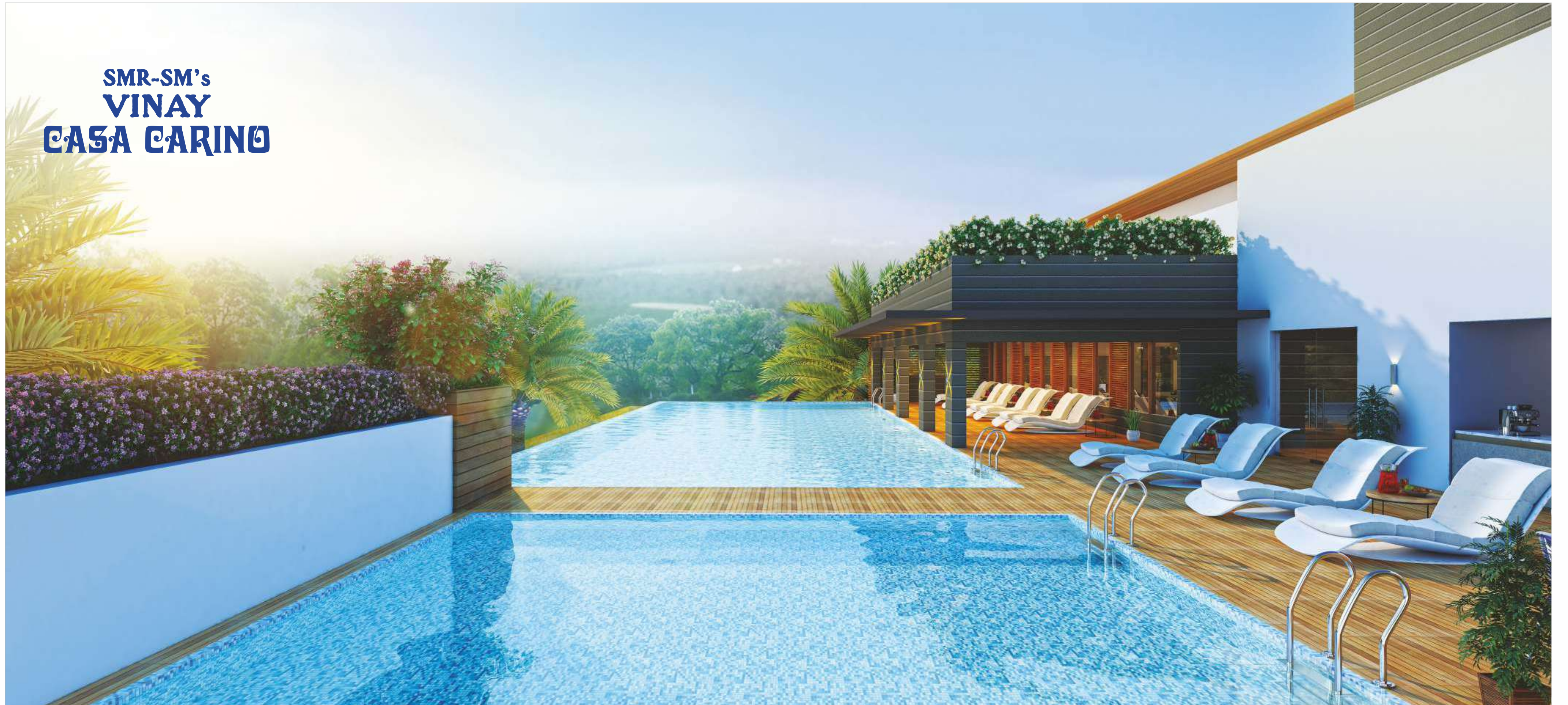
CLUB TERRACE POOL VIEW