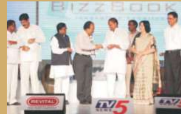
TV 5 Business Leader 2012 Award in Mid-Segment by the Chief Minister of Andhra Pradesh