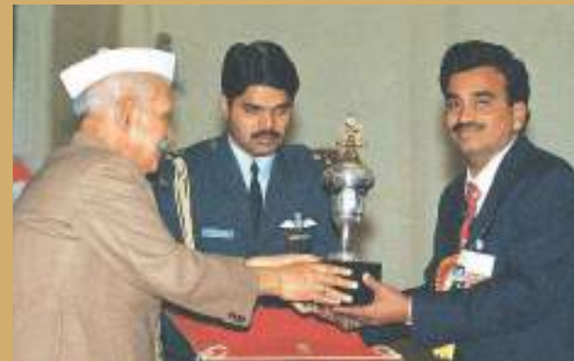
Receiving award for Best Architectural Performance from His Excellency Shri Shankar Dayal Sharma in 1996 at Rashtrapathi Bhavan