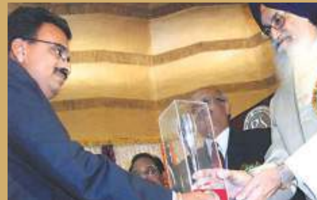
Receiving quality award for excellent & innovative construction from H.E. Shri Surjeet Singh Barnala (Governor of A.P.) in 2003