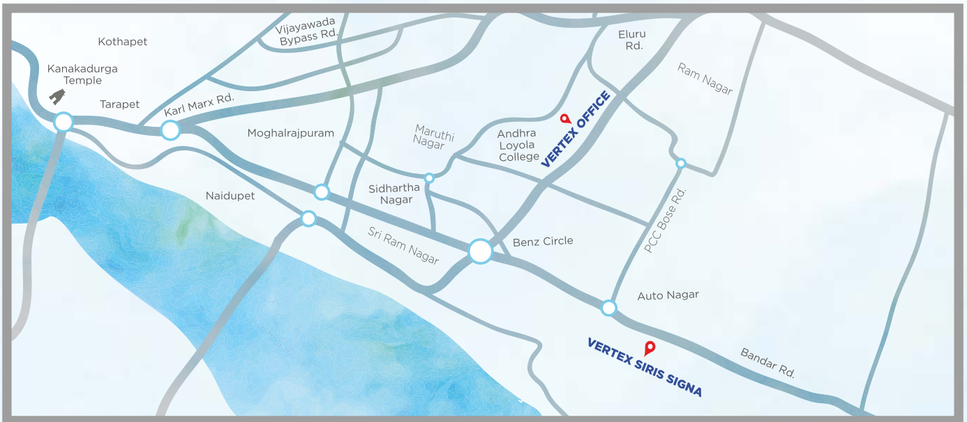
Location Map (not to scale)