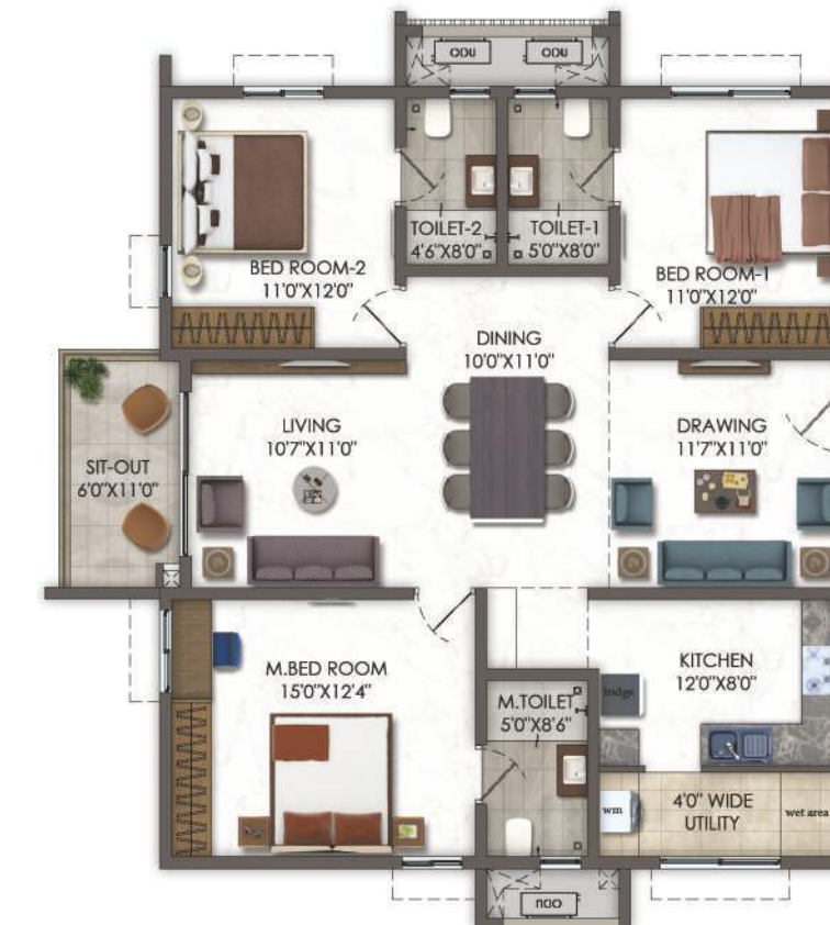
TYPE - C 3 BHK EAST FACING 1810 SFT.