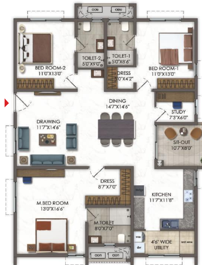
TYPE - G 3.5 BHK WEST FACING 2180 SFT.

UNIT NUMBERS IN BLOCKS BLOCK A BLOCK B BLOCK C 2 2