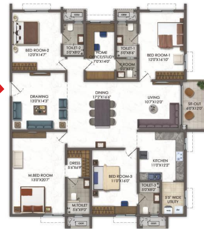
TYPE - I 4.5 BHK WEST FACING 3020 SFT.

UNIT NUMBERS IN BLOCKS BLOCK A BLOCK B BLOCK C 7 8 7