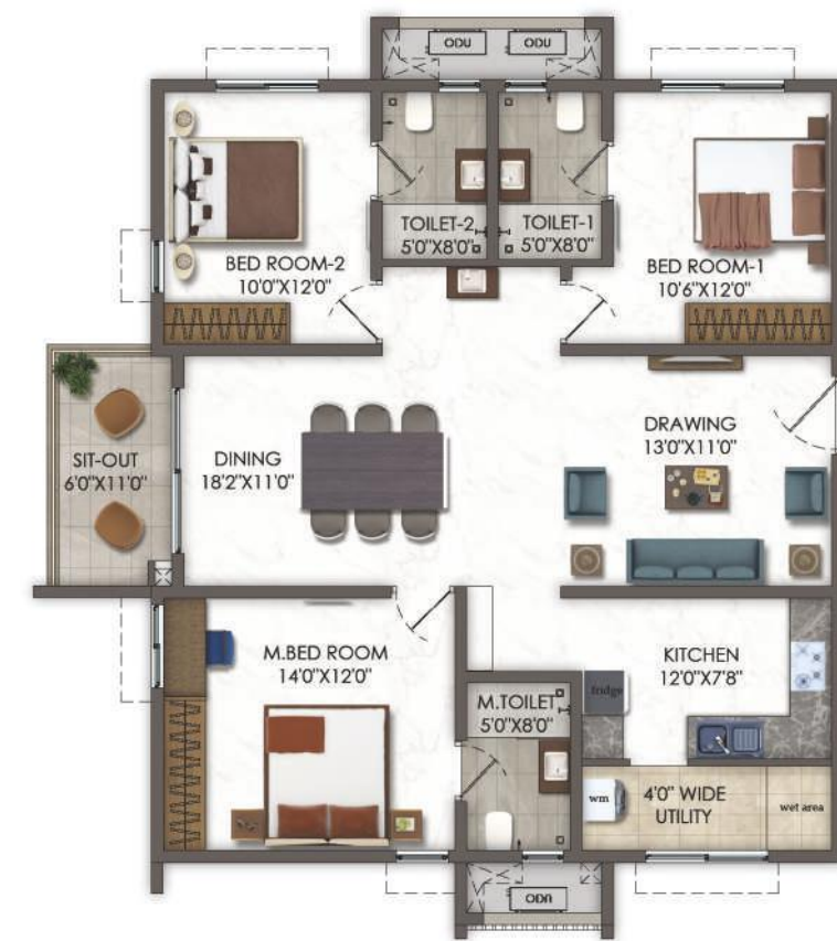
TYPE - A 3 BHK EAST FACING 1750 SFT.