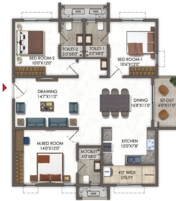
TYPE - B 3 BHK WEST FACING 1750 SFT.