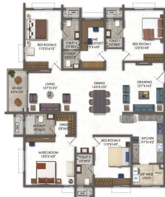
TYPE - H 4.5 BHK EAST FACING 3020 SFT.

UNIT NUMBERS IN BLOCKS BLOCK A BLOCK B BLOCK C 5