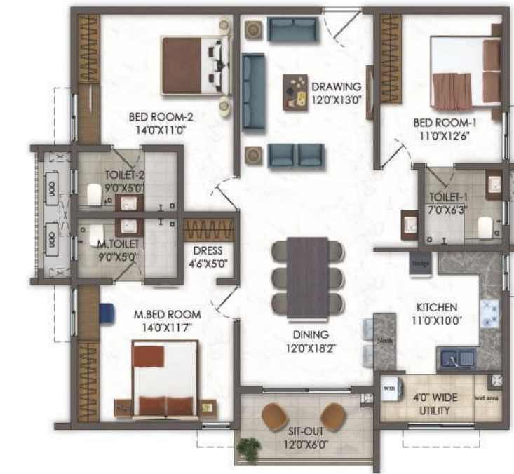
TYPE - D 3 BHK NORTH FACING 1915 SFT.