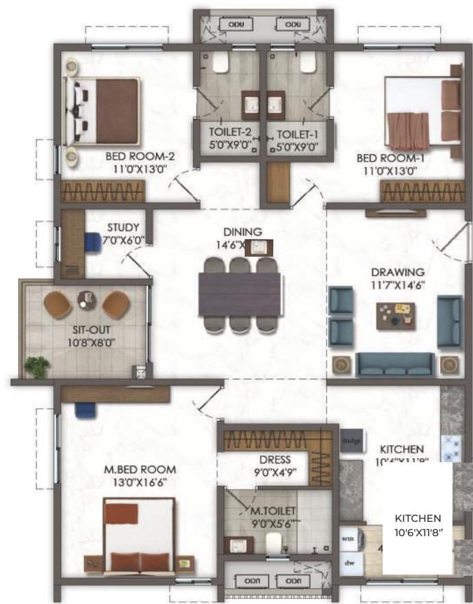
TYPE - F 3.5 BHK EAST FACING 2165 SFT.

UNIT NUMBERS IN BLOCKS BLOCK A BLOCK B BLOCK C 5