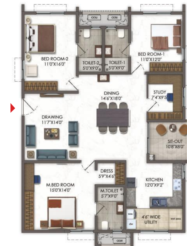
TYPE - E 3.5 BHK WEST FACING 2160 SFT.