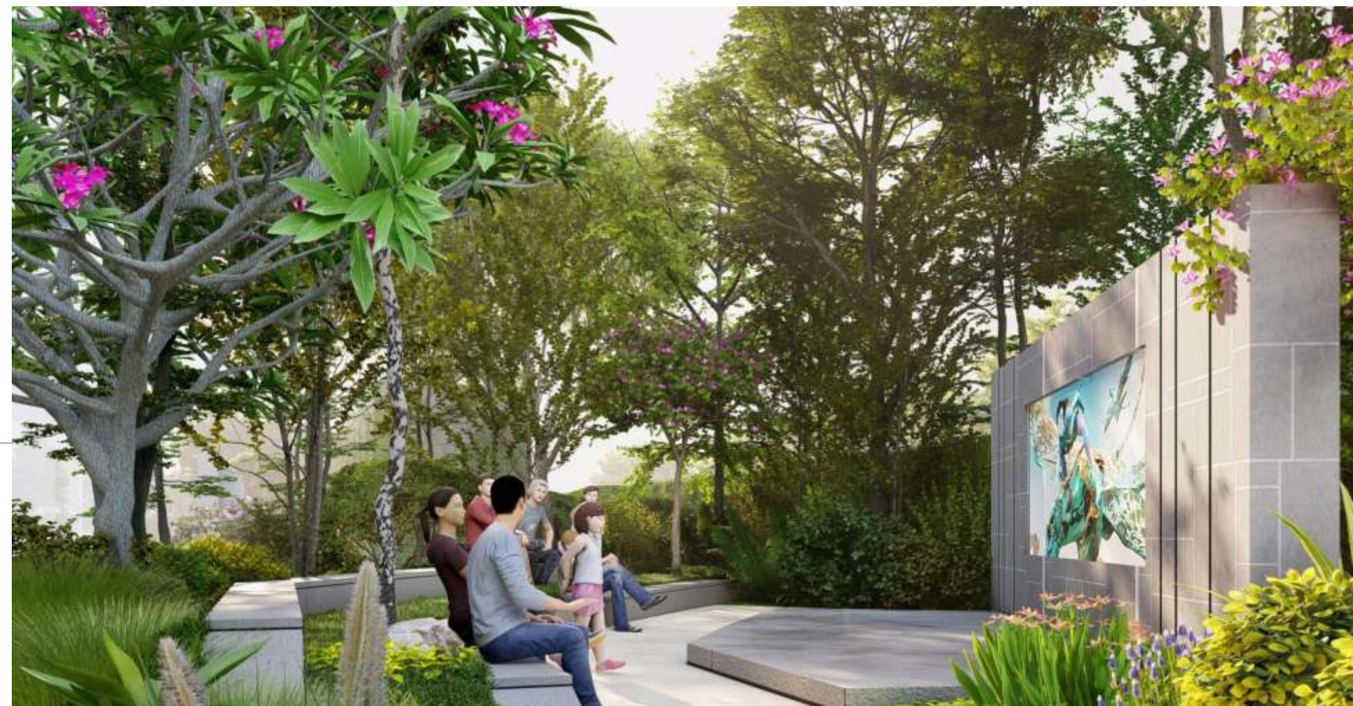
AMPHITHEATRE with stage