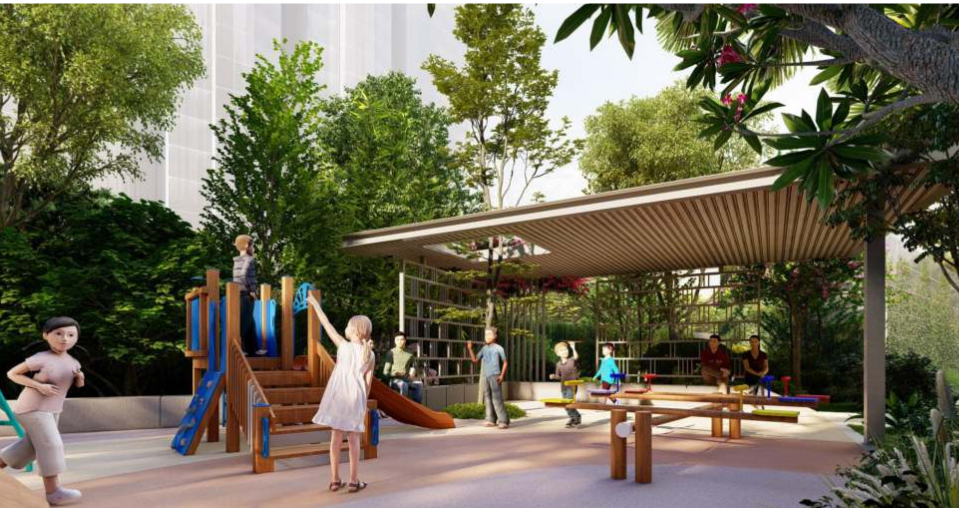
CHILDREN'S PLAY AREA with Shade Structure