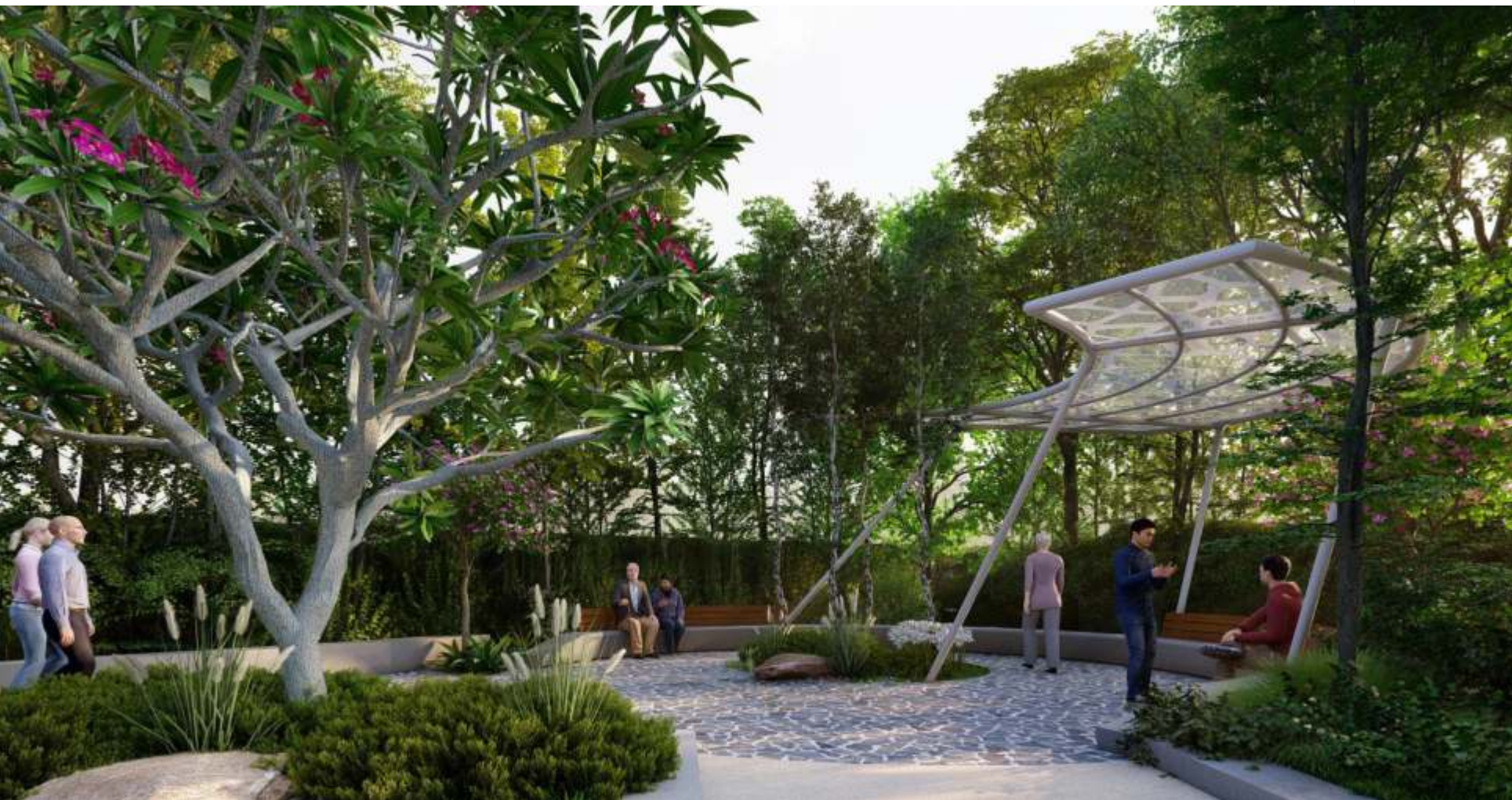
ELDER'S PLAZA with Shade Structure