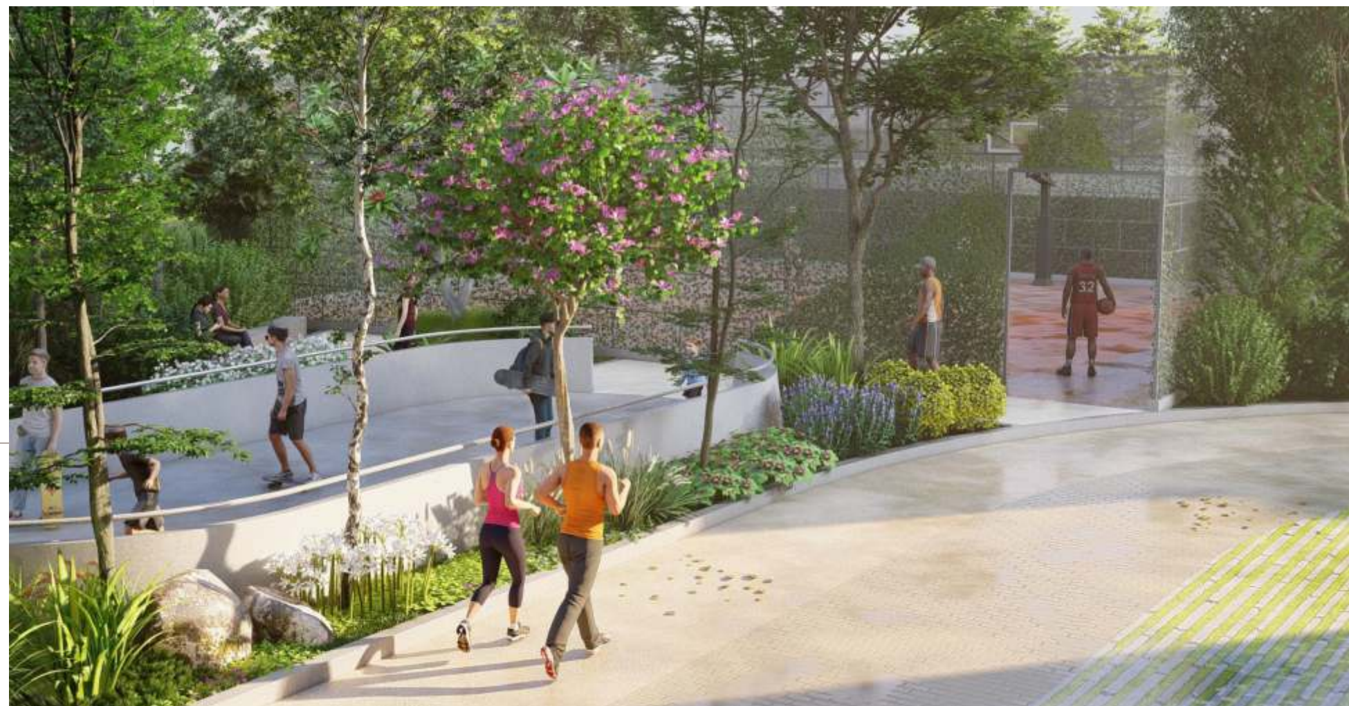
SKATING RINK Half basketball practice court and jogging track