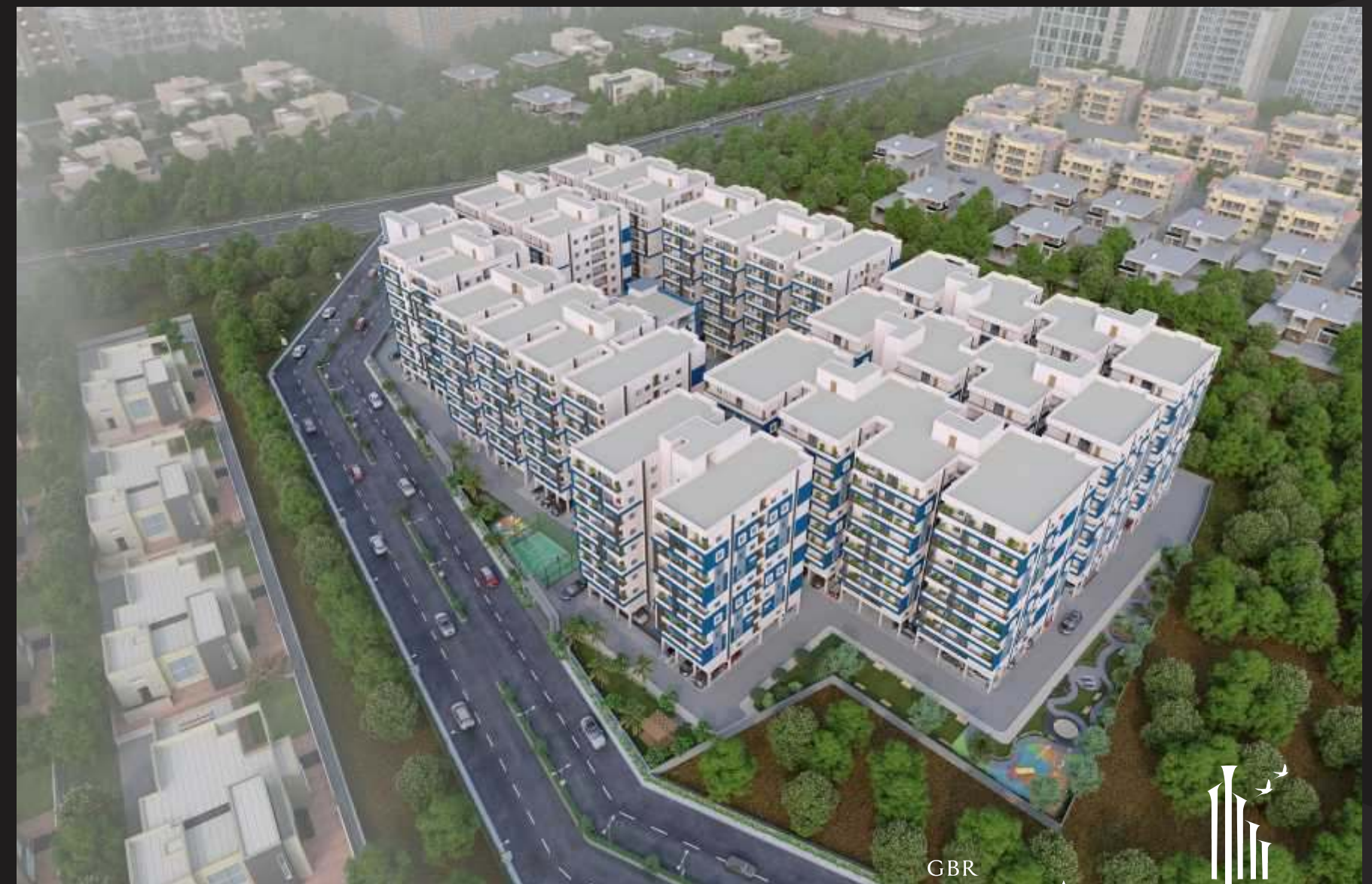
an artistic rendering of gbr dhanwin birds eye view

With over large open space and lush greenery all around, Dhanwin Towers is an oxygen-rich address. The sleek minimalist architecture stands out on lush grounds and offers opulent apartments with active outdoors and clubhouse amenities. Live it up here!