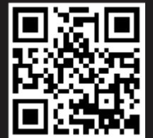
BROCHURE QR CODE