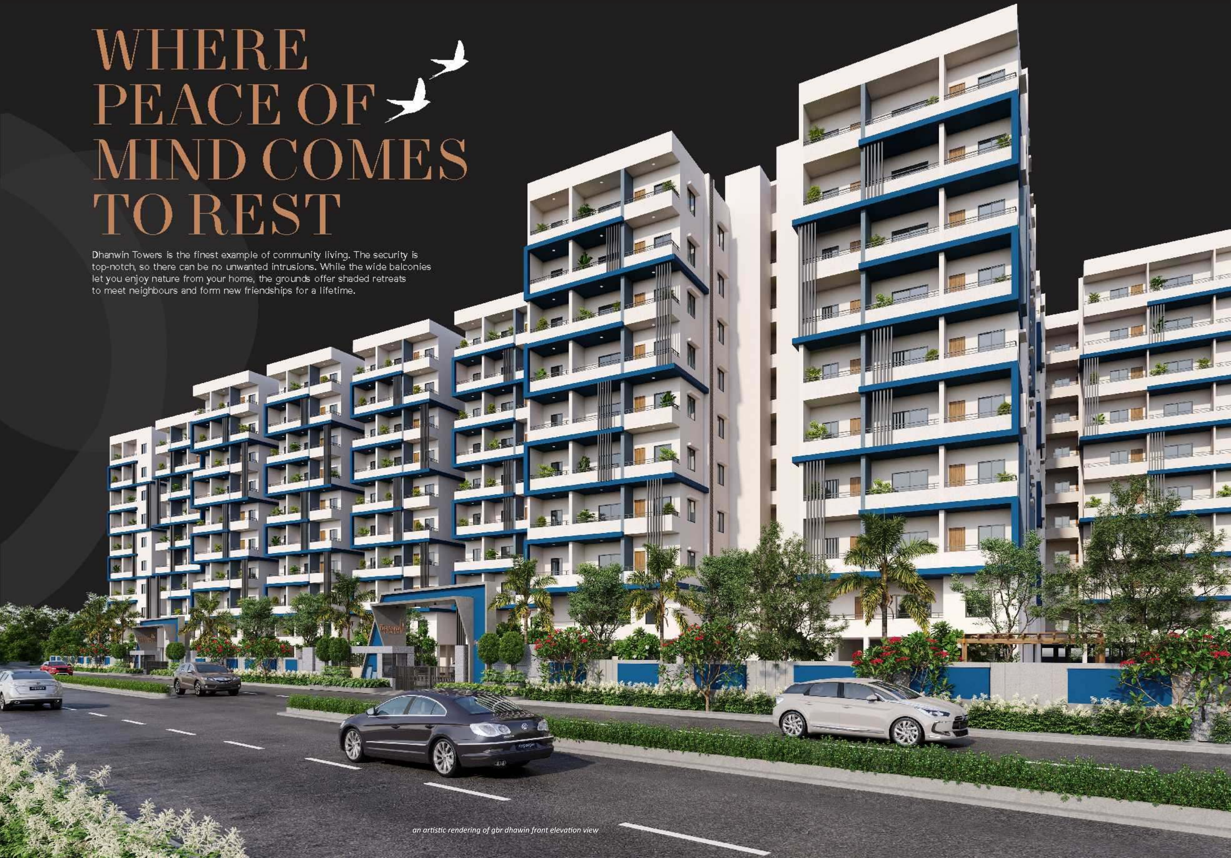
an artistic rendering of gbr dhawin front elevation view

Dhanwin Towers is the finest example of community living. The security is top-notch, so there can be no unwanted intrusions. While the wide balconies let you enjoy nature from your home, the grounds offer shaded retreats to meet neighbours and form new friendships for a lifetime.