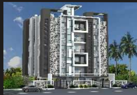
Aritha Hari Hara Block - A