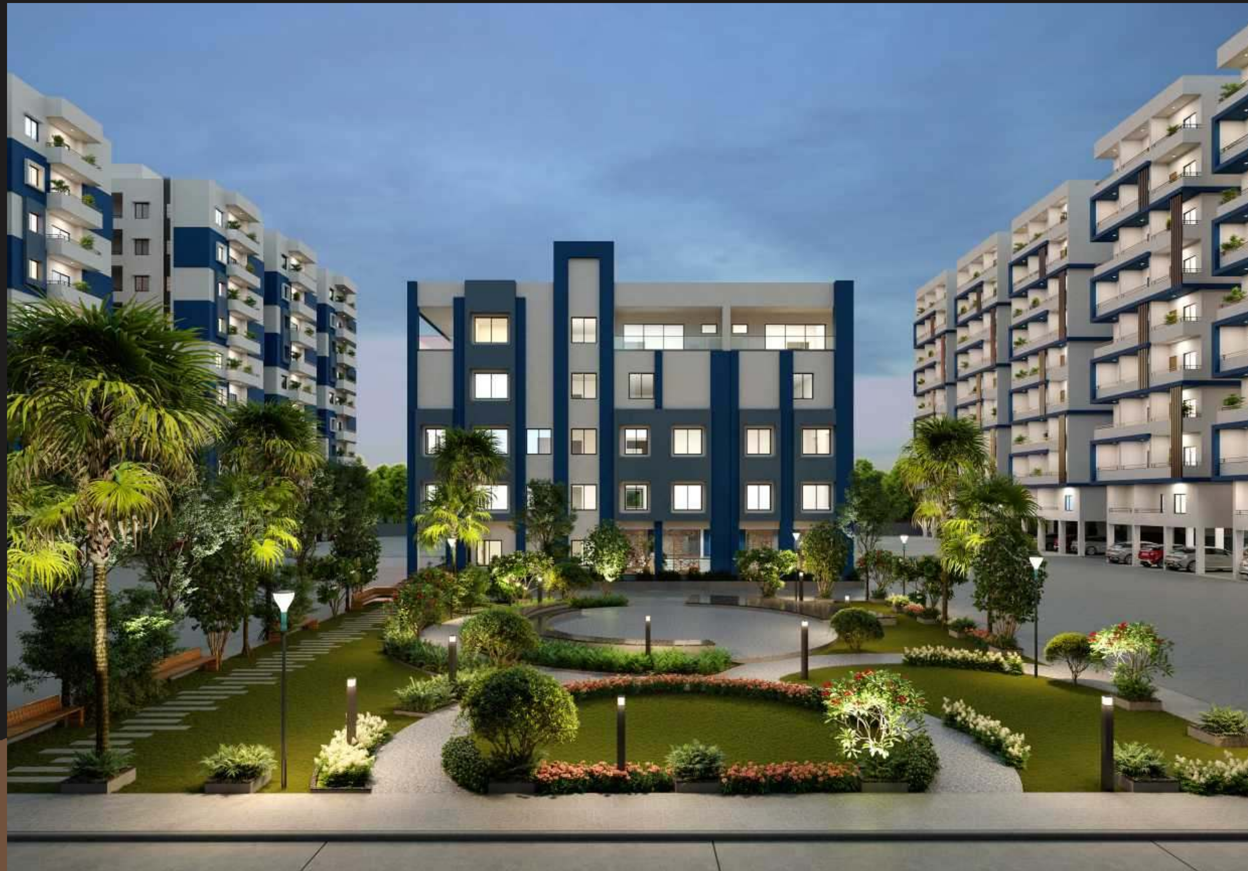
an artistic rendering of gbr dhawin courtyard view