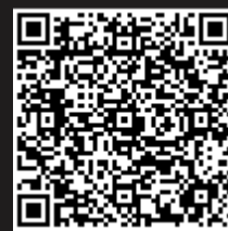
LOCATION QR CODE