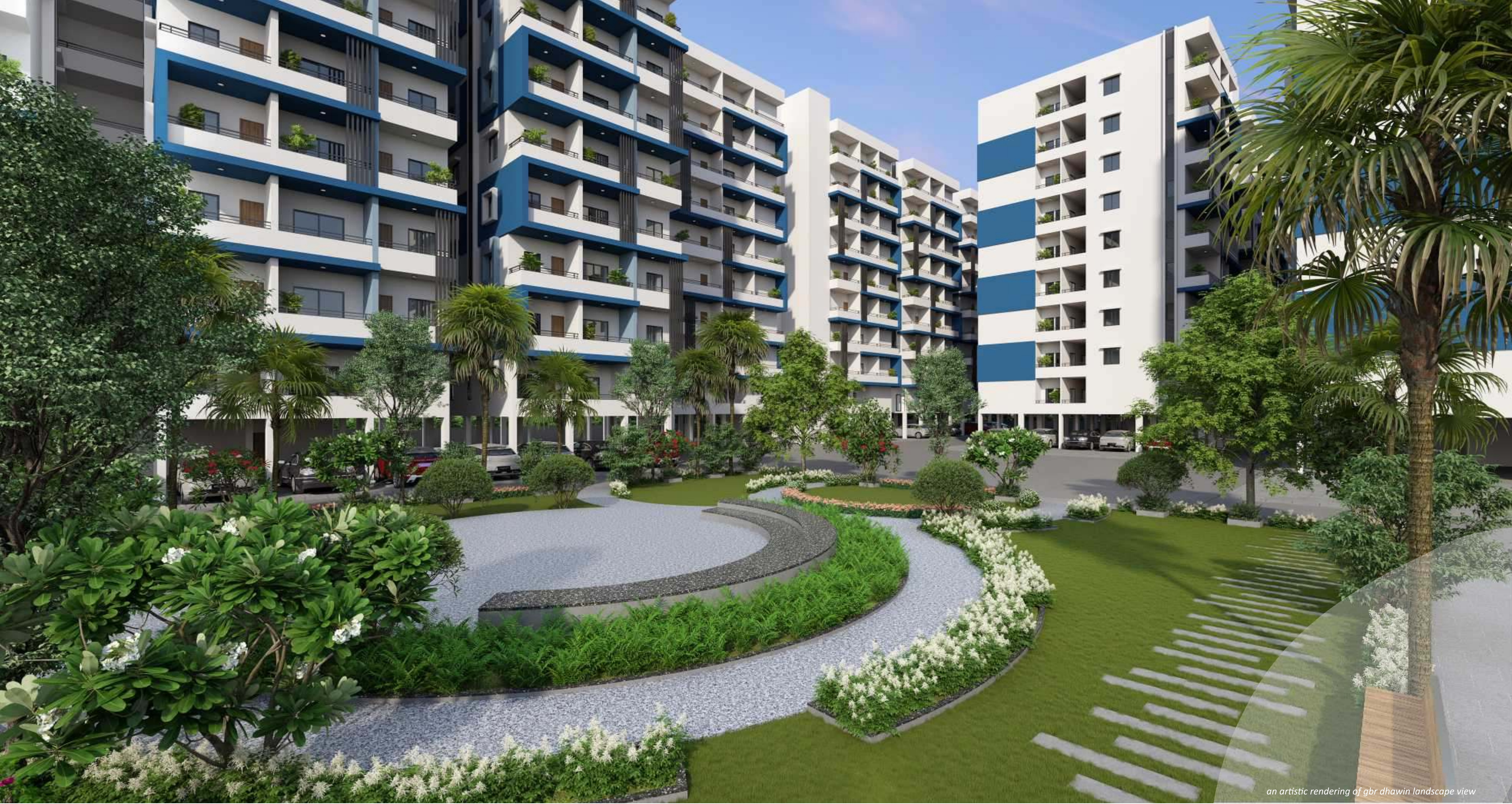
an artistic rendering of gbr dhanwin landscape view