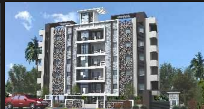
Aritha Hari Hara Block - B

The Aritha Group is one of Hyderabad's most trusted real estate companies with over 20 years of experience in building premium commercial and residential properties. The company stands out for its human connect – putting customers, collaborators, and employees above all else. The systems and strategies are aimed at on-time, on-budget delivery of the finest homes.