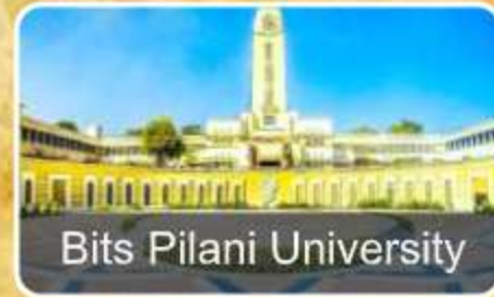
Bits Pilani University