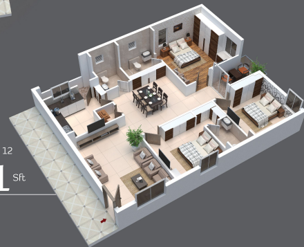
Flat No. 9, 10, 11, 12 1911 Sft 3 BHK - EAST