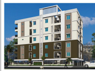
Arun Prime 2 BHK Flats @ Nandi Hills, Near TKR College Karmanghat