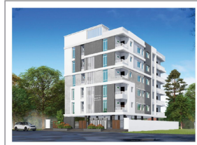
WHITE CLOUD 2 & 3 BHK Flats @ Hayathnagar