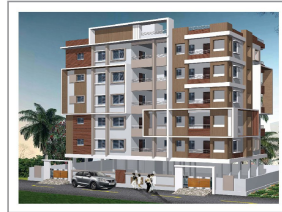
Vinila (vimala) Residency 3 BHK Flats @ Nandi Hills Near TKR College Karmanghat