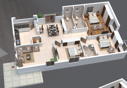
Flat No. 8 2087 Sft 3 BHK - EAST