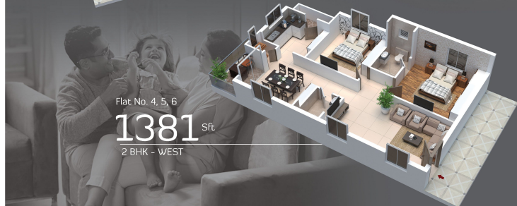
Flat No. 4, 5, 6 1381 Sft 2 BHK - WEST