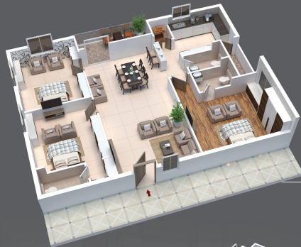
Flat No. 1 2076 Sft 3 BHK - WEST