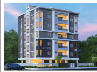
Siri Sampada Homes Bhuviya @ Brahmanapalli X Roads, Turkayamjal.