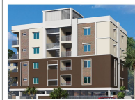
Sandhya Elite 2 & 3 BHK Flats @ Nandi Hills, Near TKR College Karmanghat