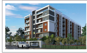
Siri Sampada Homes Bhuwana @ Brahmanapalli X Roads, Turkayamjal.