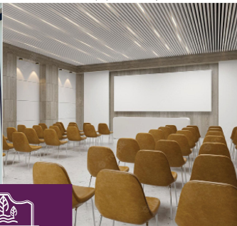
Multi-purpose community hall