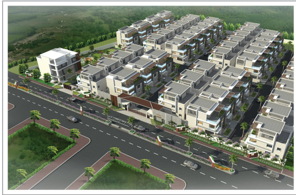
Luxury Gated community Duplex Villas @ Turkayamjal