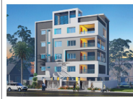
Siri Sampada Homes Pearl @ Nandihills near Hashtapuram.