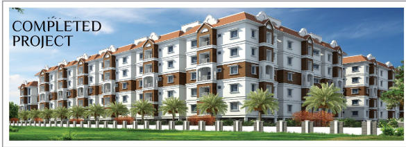
Vision Cascade Greens @ NCL North, Kompally. (Gated community 2 & 3 BHK Flats)