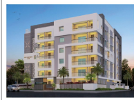
Siri Sampada Homes Anvi @ Brahmanapalli X Roads, Turkayamjal.